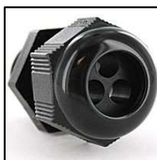
Includes 3-hole Cable Glands