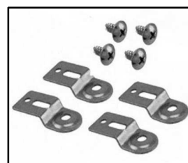
Includes Stainless Steel Mounting Brackets