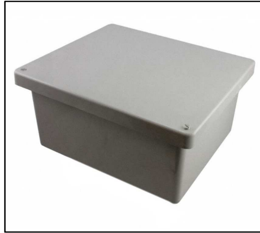
Fiberglass Reinforced Plastic Enclosure