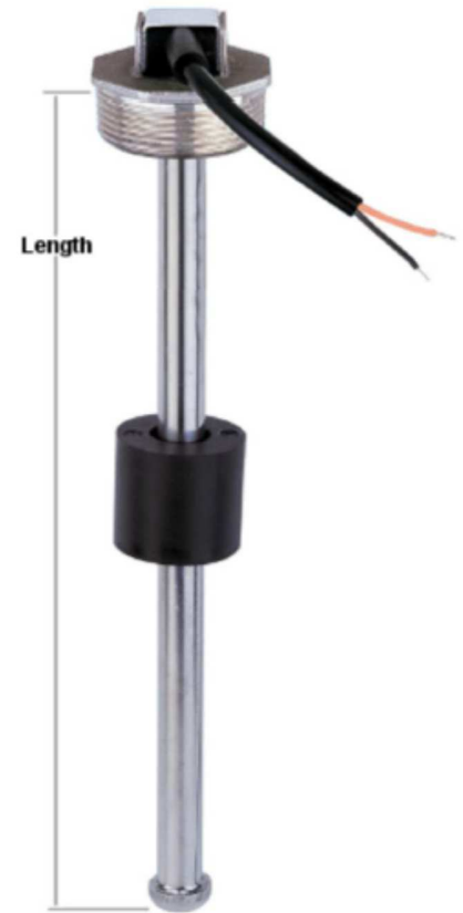
Sensor Features 316 Stainless Steen Construction