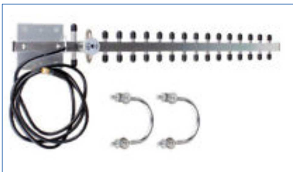
Optional Antenna Model: AT24-12DBI-YD-RP-SMA

Regulatory: FCC Part 95 (No license required) FCC(USA): OUR-XBEEPRO, IC (Canada): 4214A-XBEEPRO