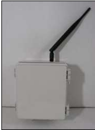
NEMA 4X Receiver