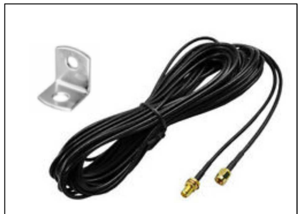
Includes 9' Antenna Remote Mount Kit