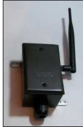
Painted Aluminum Receiver