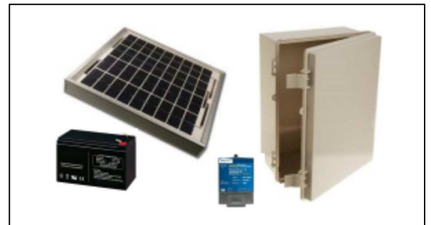
Solar Kit Includes Panel, Battery, Charger, Enclosure