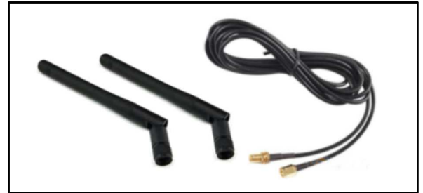
Includes 5dbi Antennas and 9' Antenna Extension Cables