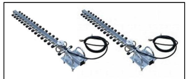
Optional Long Distance Antenna Set