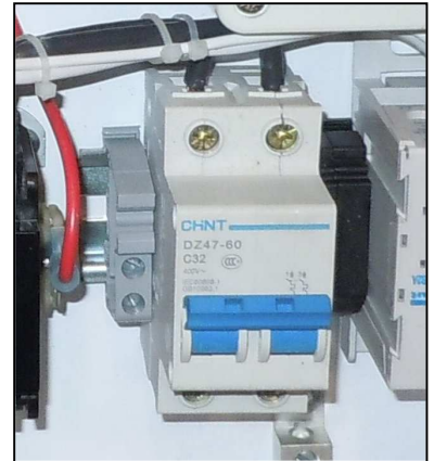
Optional Circuit Breakers