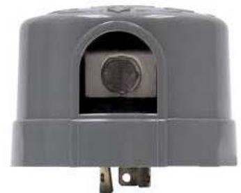
Works with Twist-lock Photocell Sensors (Sensor not included)