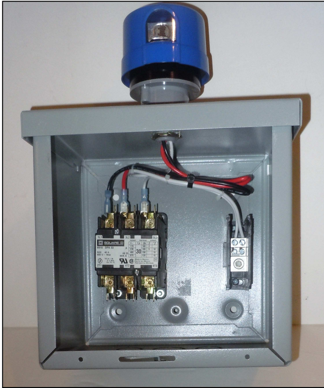
Mode: LCP-MB-120/240-3P-30A Shown