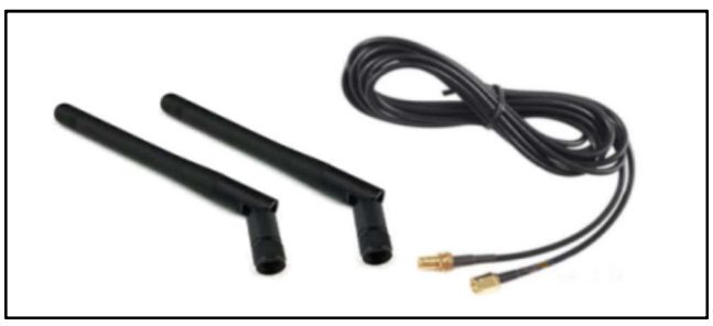
Each Set Includes 5dbi Antennas and 9ft Antenna Extension Cables